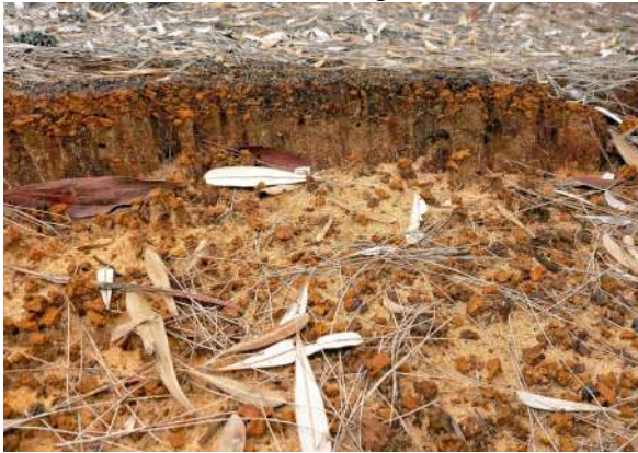
Soil profile evolved from bare sand in <20 years