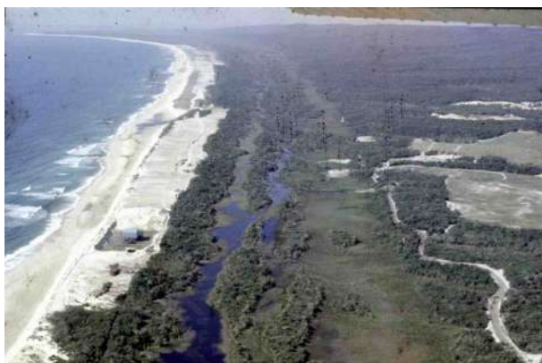
Aerial view of Fraser Island sandmining just before it ceased in December 1976. The narrow coastal strip on the left was QTM and the Dillingham operations are on the right. This is what FIDO stopped.