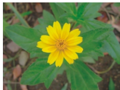
Singapore daisy flower