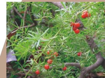
Fox-tail asparagus seeding