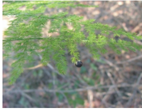
Ferny climbing asparagus seedling

Chemical Control: Foliar spraying is not effective because of the fine nature of the foliage. In trials at Sandy Cape Lighthouse, Triclopyr (Garlon) and diesel caused dieback but not death and Fluroxypyr 200g/L (Starane 200) and diesel (35 ml to the litre) resulted in about 60% mortality of crowns. Native plants were greatly affected by the drift and high mortality resulted.