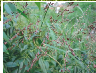
Green panic seed heads