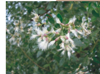
Groundsel in flower