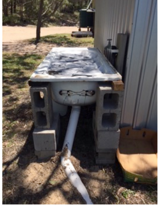
The collaboration with the Queensland Parks and Wildlife Service that allows FIDO to use the Eurong Nursery to propagate the plants needed by residents and FIDO for urban bush regeneration. It is critical to ensuring that no plant propagation material leaves K'gari and that nothing is brought on. Installation of a pot washing facility is just another fundamental quarantine practice.