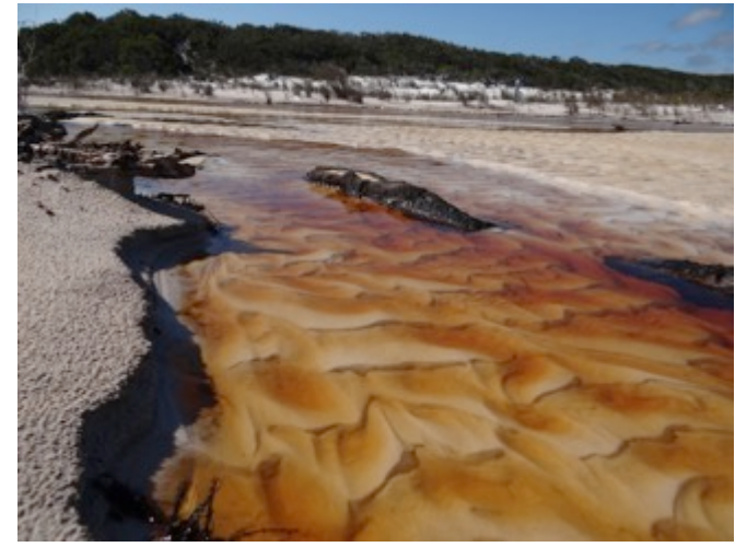
These ever-changing chaotic patterns occur on Boomanjin shores