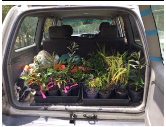
Delivering 60 plants from Eurong nursery to be used in FIDO's bush regeneration