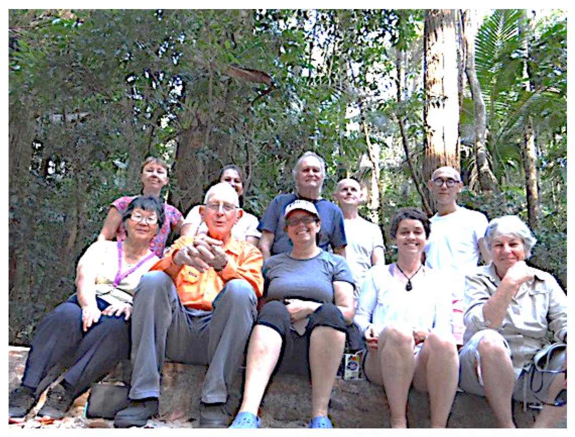
The FIDO Weedbusters team at Pile Valley