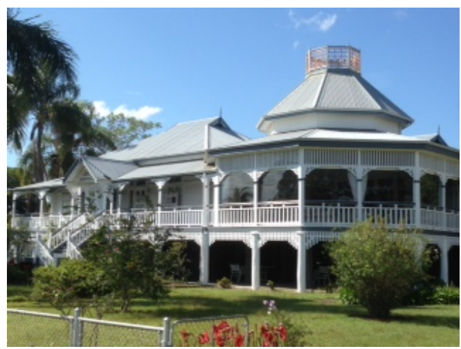
One of Maryborough's grander Heritage houses

The trip to Eurong wasn't arduous. We had a morning tea break at Yandina and arrived at Gympie at 11.45 with the Pomona group not far behind. The earlier lunch allowed us time to do a couple of walks in Maryborough to get a quick appreciation of the Heritage precinct and later the John Street Precinct of Heritage houses.