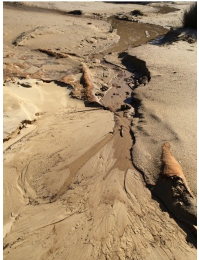
Fraser Island's shortest creek start to finish — Kirrarr Sandblow