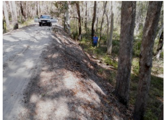
A road viaduct 2 metres above the surrounds created by road sediment sluiced down from the road above.