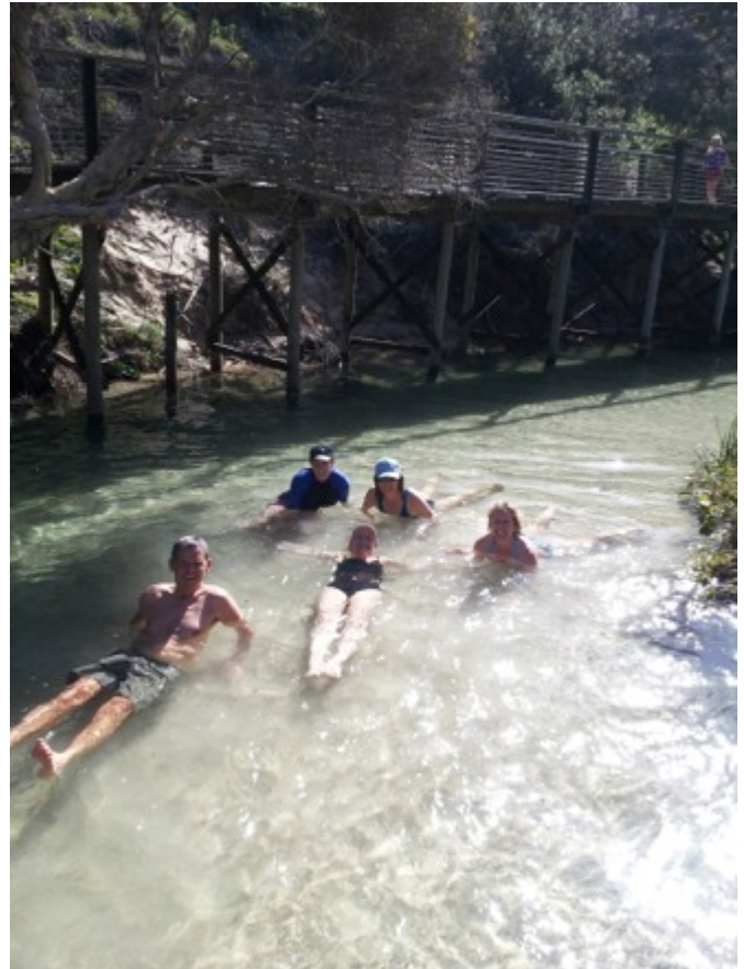
Gold Coasters wallowing in Eli Creek