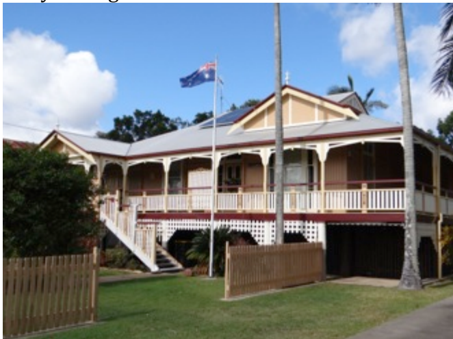
A classic Maryborough Queenslander