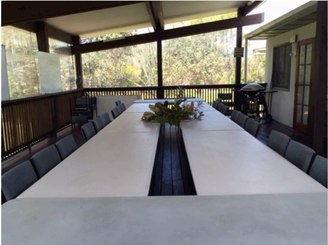
The Dilli Village Eastern Deck. This is where all meals will be served: Tables can and will be in different configurations according to the day. Based in anticipated numbers meals may be served here in two sittings.