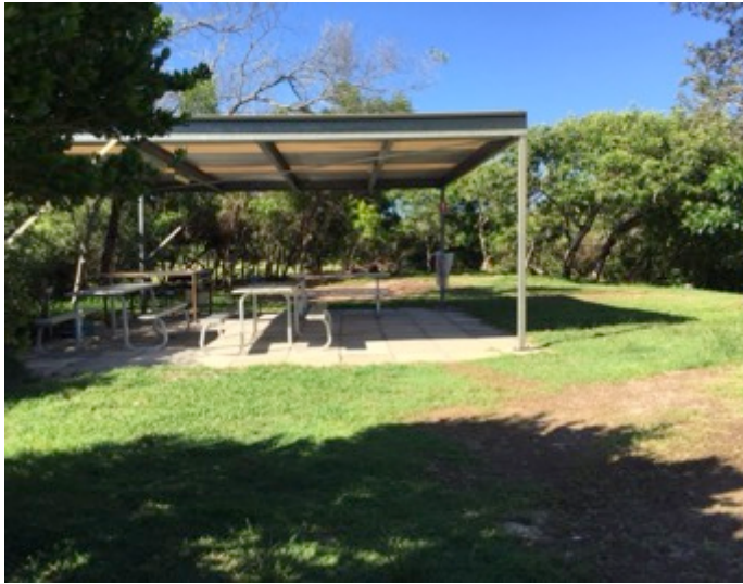
A Camp Kitchen

The campground is open and is covered with a well-maintained lawn. There are 15 family sites (suitable for camper vans or larger groups) and 9 small sites. Several sites have access to power. There are two camp kitchens although during the BioBlitz only one will be available for campers as the other will be used for round table discussions and for sorting through specimens.