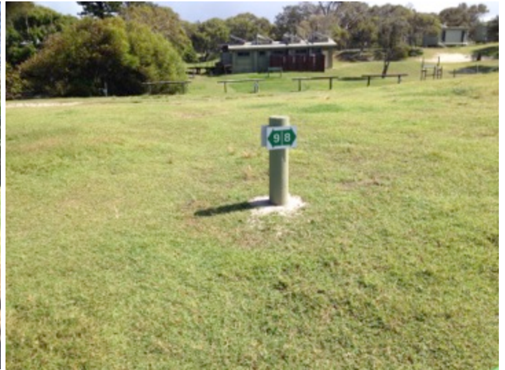
The Grounds Note the Amenities block