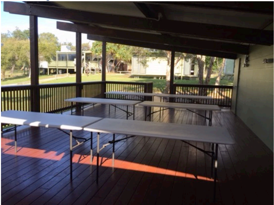
The Southern Deck/Learning Facility. This area can also be set up in different configurations according to the needs on the day.