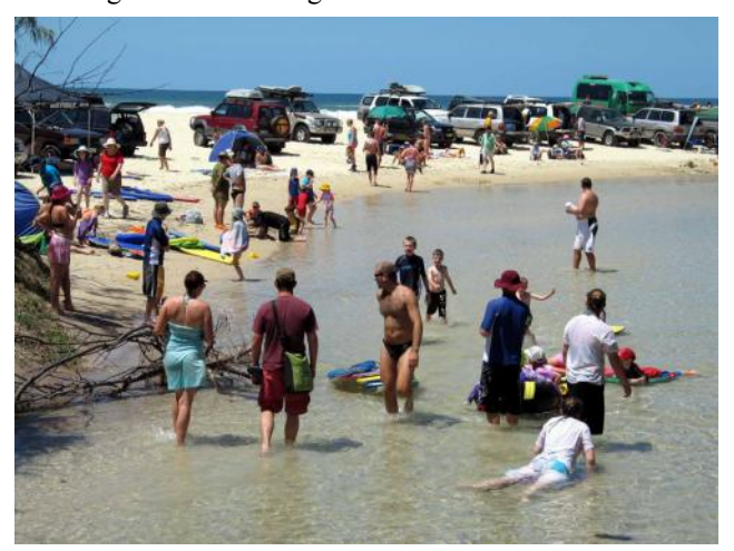
(Above & front page) Eli Creek 4 October 2006. There were over 80 vehicles including buses parked around this creek.

Seeking a second best solution to where Fraser Island might have been recognized, FIDO turned to the Queensland Heritage List. Here we found that while Fraser Island was left off the list, the Sandy Cape Lighthouse was included. In Queensland the bias in the Heritage Register is not just against Fraser Island but it is against all natural areas. The Lamington Bridge in Maryborough is registered but not the Lamington National Park that is one of the major Queensland National Parks in the CERRA World Heritage area. While the terms of reference of the Heritage Council might so skew it in favour of the built environment that it has overlooked the most obvious contenders for natural heritage recognition, the fact remains that Fraser Island and other natural areas of Queensland remain as Cinderellas when it comes to official government recognition.