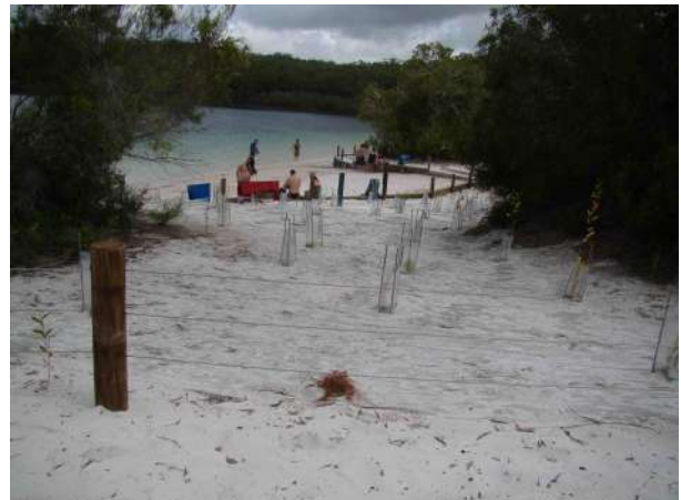
The penchant for plantations on beaches has been previously well demonstrated by the QPWS at the Pinnacles where another plantation was established.

The fencing raised many comments but now the landscaping of the beach has gone much further. FIDO was alarmed to discover the dramatic transformation of Boorangoora's beach with a totally unnatural plantation (albeit all native plants to the area). With the new fencing and the artificiality Lake McKenzie (Boorangoora) one of Fraser Island's best known icons has lost an enormous amount of charm and naturalness.