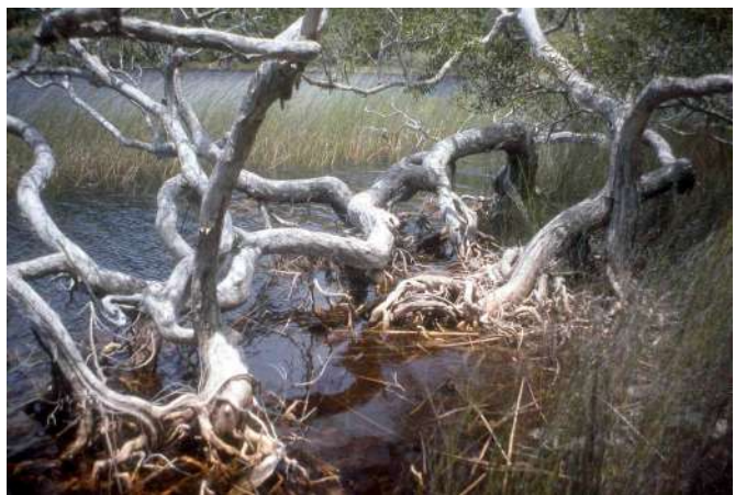
Only walkers are able to see these magnificent contorted Melalueas in Hidden Lake - part of the George Haddock Track.

The Impacts of Getting to Specific Sites summarizes the major impacts of some of Fraser Island'.