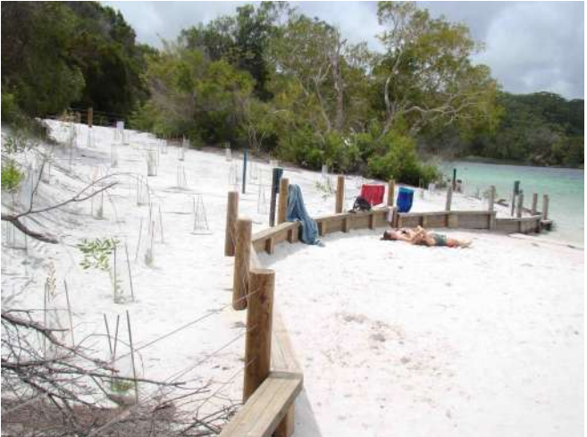
Improving the Aesthetics of Lake McKenzie (Boorangoora) ? The War On Weeds

FIDO still believes that Fraser Island still meets the World Heritage criteria for which it was nominated, but many of these values are increasingly under threat. More resources are required to monitor and manage them. Without more Commonwealth Government financial contribution to the management of the island's World Heritage values and critical scrutiny of the day-to-day management, the environmental degradation will only continue.