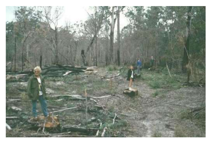
Blackbutt stumps in Block 14 are marked by people after clear-felling in 1988. Myrtle Rust may be as effective as chainsaws in decimating Fraser Island's forests.

Rusts are highly transportable. Their spores can be spread via contaminated clothing, infected plant material, on equipment and by insect movement and wind dispersal. These types of rust affect commercial plant growing operations and native ecosystems. They typically attack young plants and new growth on established plants. Although it can be controlled in commercial operations with the use of fungicides this is not feasible nor necessarily desirable on a large scale.