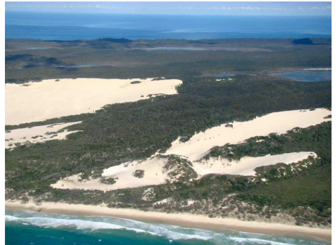
Fraser Island Top End Sandblows and Lakes - 17 August 2011

Flight: In August FIDO chartered a flight to explore as much of the Great Sandy region as we could afford to update our photographic library of Fraser Island. During a two-hour flight from Maroochy to Sandy Cape and return we captured over 1,000 images of Fraser Island and Cooloola so that we will have a basis for comparing future changes to the island and monitoring change. The last aerial survey of Fraser Island's Top End was made in 2003.