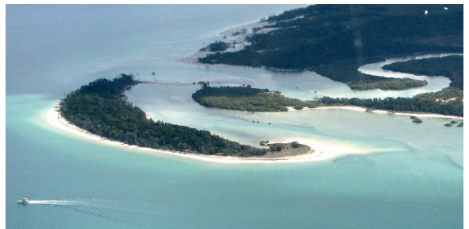
MOON Point as seen 17 August 2011. Rising sea levels and coastal erosion have transformed Moon Point to an island

FIDO waits to see if the Commonwealth demonstrates any increased interest in what happens on Fraser Island following this Parliamentary exchange or whether the Feds will continue to back away from their responsibilities to protect Fraser Island’s World Heritage values. During this session Senator Ludlum observed that there had been a 31% cut to the budget for the Heritage division. Since then there has been a dramatic reorganization of responsibilities within the Federal Environment Department and the Heritage Unit and it seems Fraser Island could get even less attention — but we won’t pass judgment yet.