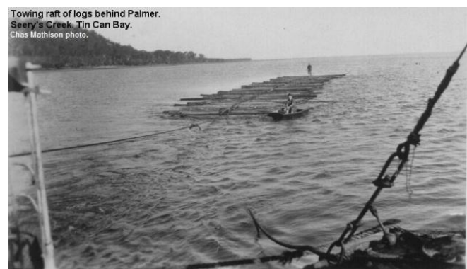
Towing raft of logs behind Palmer. Seery's Creek, Tin Can Bay.