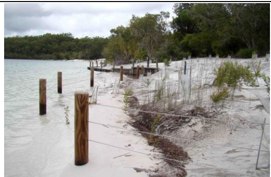
See what has become of the Lake McKenzie beach https://picasaweb.google.com/106668843048738450637/ModifyingLakeMcKenzieBoorangooraBeach#

A Fauna Management Plan? Whatever the reasons for the wildlife decline, sediment on marine meadows, cane-toads, changed fire regimes, human disturbance or predation, the situation is serious. DERM has a Dingo Management Plan that FIDO supports but that plan addresses the management of only one species. FIDO is wanting a Fauna Management Plan to look at all fauna species to ensure that Fraser Island doesn't slowly slide along the same path that is seeing the disappearance of Kakadu's fauna.