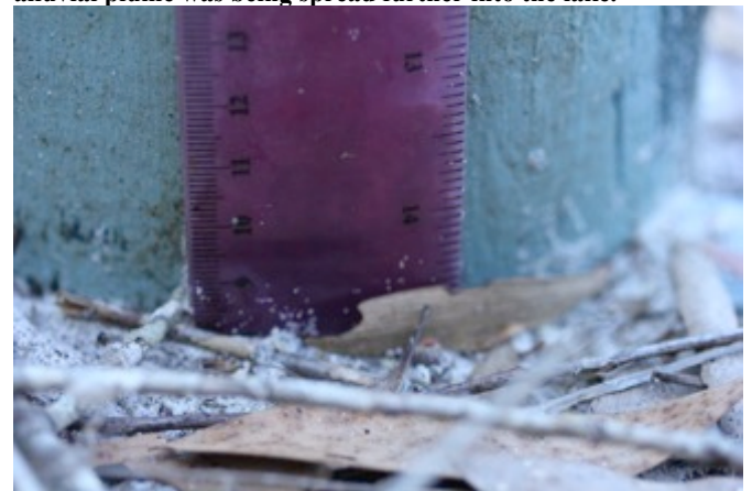
On 27<sup>th</sup> September 2015 a passer by recorded 8 cms buildup of sand at this site in just under four years. While Lake McKenzie (Boorangoora) isn't in imminent danger of filling up with the sand washed off the road, the much longer-term prognosis looks bleak unless traffic is diverted much further away from the site. Future generations will be deprived of a rich experience.