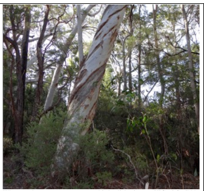
Why are the most common trees hit by lightning on K'Gari Scribbly Gums and why do most of those also have spiral grain?

It is understood that gathering the data should not be difficult. Some data such as the monthly returns from commercial tour operators should make it relatively easy to at least release numbers of visitors carried on Commercial tours but extracting information from QPWS relevant to critical issues isn't easy when it should be so readily available.