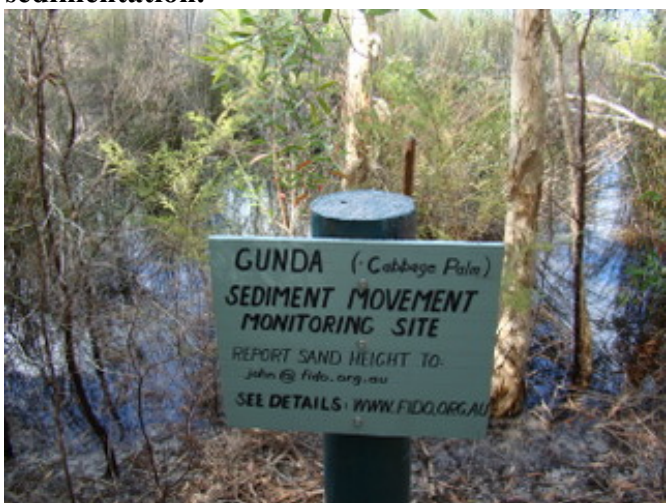
On 30 November 2011 FIDO installed this post on Boorangoora'a shores where sand washed down from the nearby road was forming an alluvial plume.

Three photos tell the sad slow story of Lake McKenzie (Boorangoora)'s slow death by sedimentation.