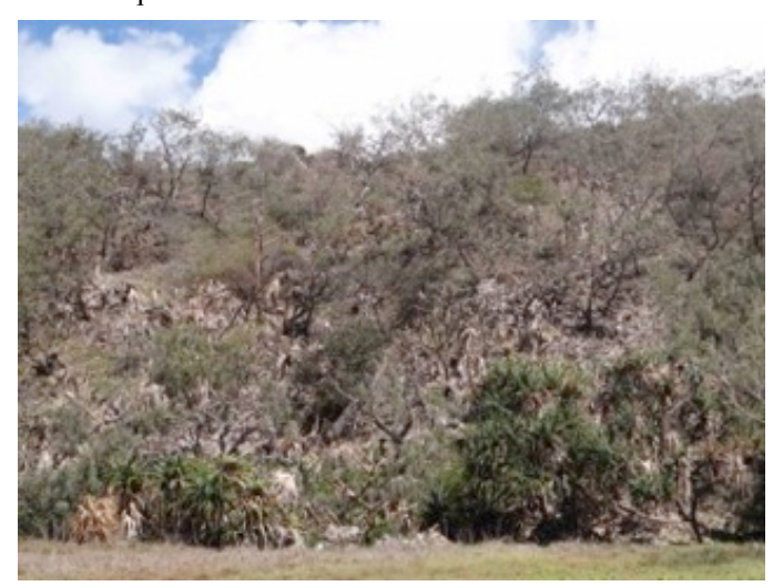
Most Pandanus along the foredunes between Happy Valley and Eli Creek devastated and killed by the Jamella impact

General Obligation: Queensland 's new biosecurity laws will make everyone responsible for managing biosecurity risks and threats under their control. This general biosecurity obligation means that all reasonable steps must be taken to stop the spread of a pest, disease or contaminant and the likelihood of the risk causing a biosecurity event and to limit the consequences of such an event.