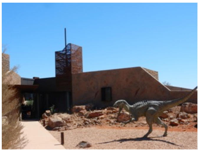
The Age of Dinosaurs Museum in a spectacular location 25 kms from Winton is run by a not-for-profit foundation

The Age of Dinosaurs Museum has a spectacular 1,800-hectare location atop a large mesa 20 kms outside Winton. The land was donated to the foundation. It is such a "must-see", that it causes people to stay an extra day in Winton. What is interesting is that it has been built by a private foundation in a collaborative effort supported by $500,000 Queensland Government's Q150 Legacy Infrastructure funding, $500,000 from Winton Shire Council plus more funding from other sources. The foundation now is mainly financially self-supporting but is looking everywhere for more funds.