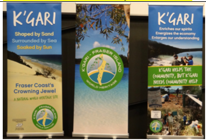
Three banners gracing the stage for the 6<sup>th</sup> Biennial Fraser Island conference attended by over 100 delegates

Backgrounders: This MOONBI includes the Second of a series of Backgrounders on Balarrgan (North White Cliffs) that has been a central part of K'Gari's recorded history. The other backgrounder deals with the sad and ongoing disappearance of K'Gari's archaeological relics, particularly scar trees. More needs to be done to preserve these relics.