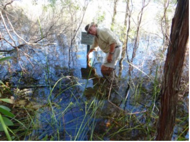
On 13 March 2013 the lake level had risen over a metre and the alluvial plume was being spread further into the lake.