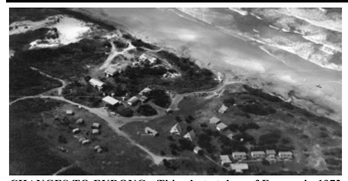
CHANGES TO EURONG: This photo taken of Eurong in 1972 shows caravans spread over the field that was to become the site of the Eurong Resort. The sandblow at the top of the photo has been colonized by vegetation. The foredune area has extended seawards by about 50 metres and is now covered with dense shrubbery. Most of the buildings except the A-frame houses remain but many new and larger buildings infill the spaces.

How many plants? When the Great Sandy World Heritage nomination was prepared it listed 622 vascular plants in 1991 for Fraser Island. 786 species were on the list by 1997. The list in 2015 stands at 992 species. The list could exceed 1,000 with a well-directed Bioblitz supported by FIDO and FINIA now in the planning stages.