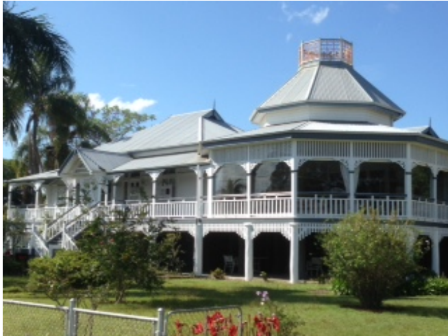
One of Maryborough's grander Heritage houses

The trip to Eurong wasn't arduous. We had a morning tea break at Yandina and arrived at Gympie at 11.45 with the Pomona group not far behind. The earlier lunch allowed us time to do a couple of walks in Maryborough to get a quick appreciation of the Heritage precinct and later the John Street Precinct of Heritage houses.