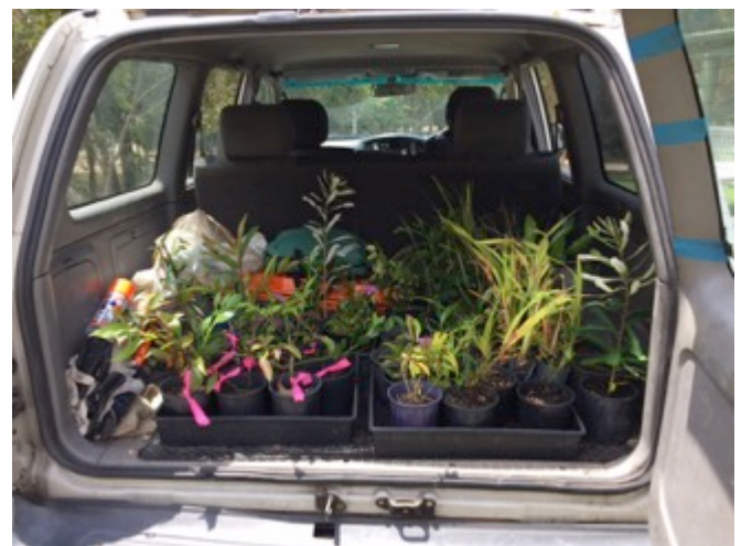
Delivering 60 plants from Eurong nursery to be used in FIDO's bush regeneration