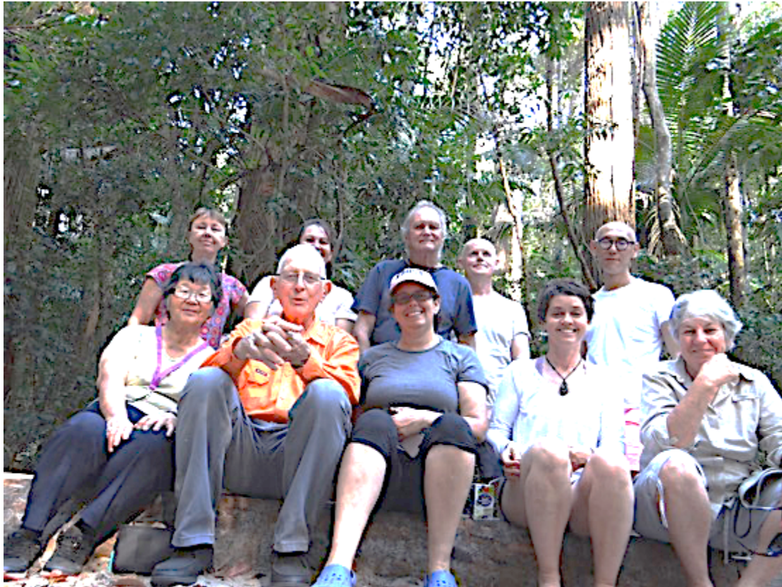
The FIDO Weedbusters team at Pile Valley