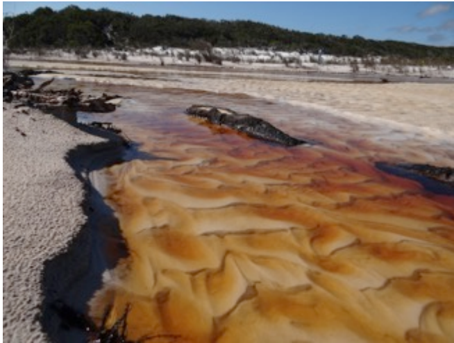
These ever-changing chaotic patterns occur on Boomanjin shores